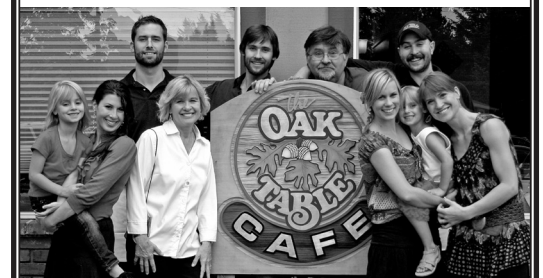
The Oak Table Cafe • Founded in 1981 by the Nagler family

Homemade American Style Potatoes..... 4.95 Tender Juicy Ham..... 5.25 Gourmet Canadian Bacon..... 5.75 Thick Sliced Bacon..... 5.50 Country Style Sausage or Links..... 4.95 One Egg..... 2.80 Two Eggs..... 3.80 Toast with Old Fashioned Preserves..... 2.75 English Muffin with Preserves..... 2.85